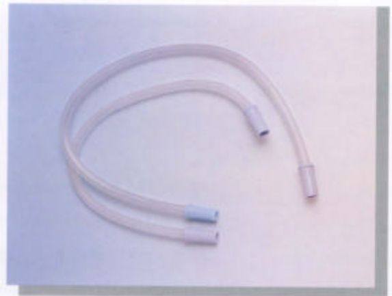
▲ Connection Tubing

* Specifications Are Subject To Change Prior Notice