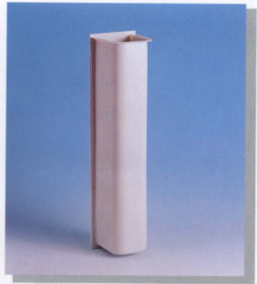
▲ Suction Catheter Holder