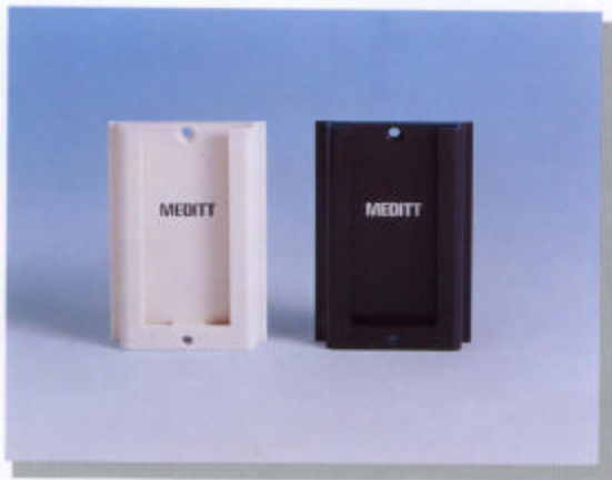
▲ Slide Bracket