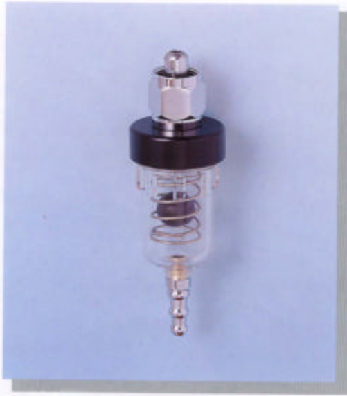
▲ Vac Trap Jar